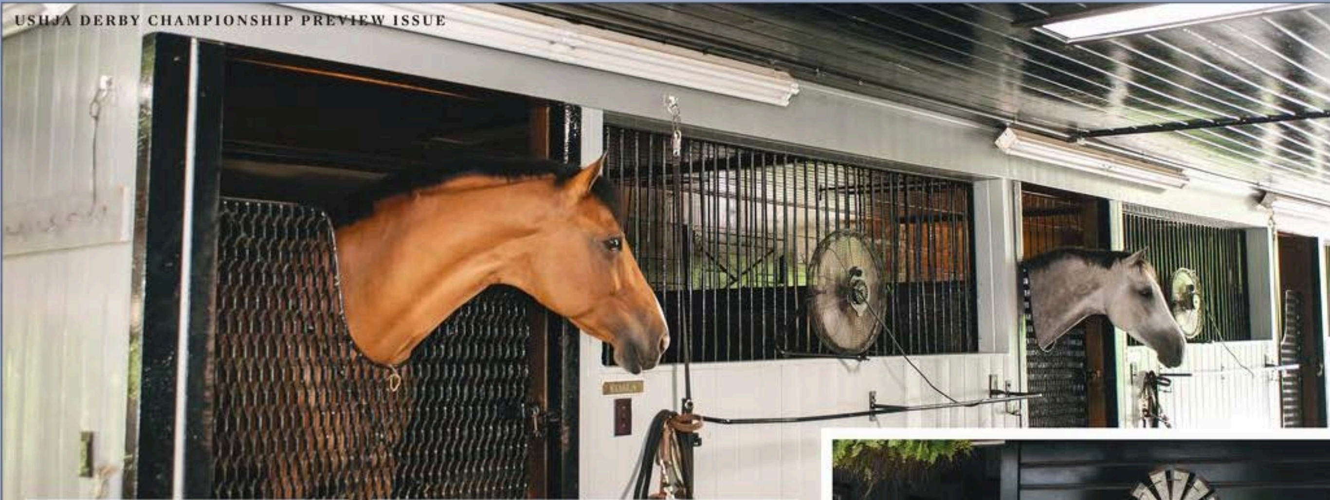
There are 19 stalls in the Ingrams' stable at River Circle Farm.